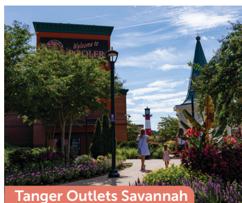
Tanger Outlets Savannah