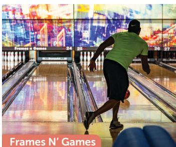
Frames N' Games