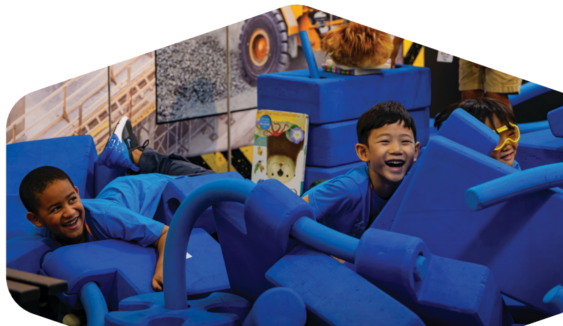
Endless fun at the Children's Museum of Pooler.