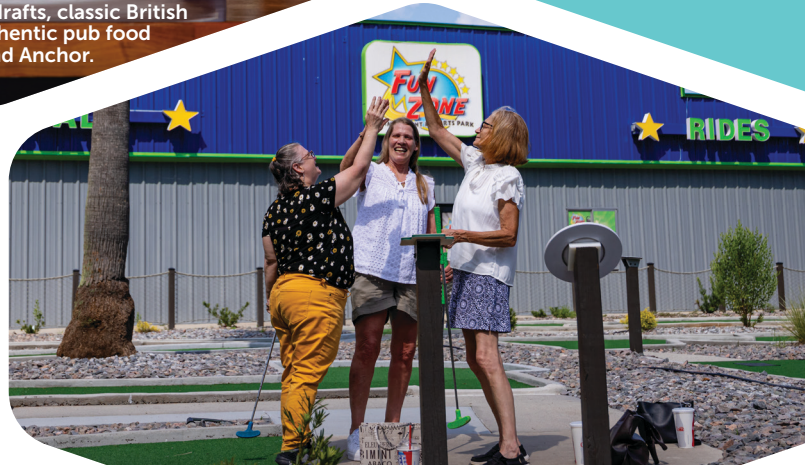
Have a blast at Fun Zone with video games, go karts, and mini golf!