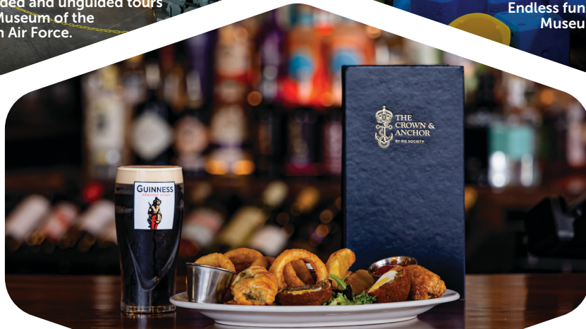
Indulge in European drafts, classic British cocktails, and authentic pub food at Crown and Anchor.