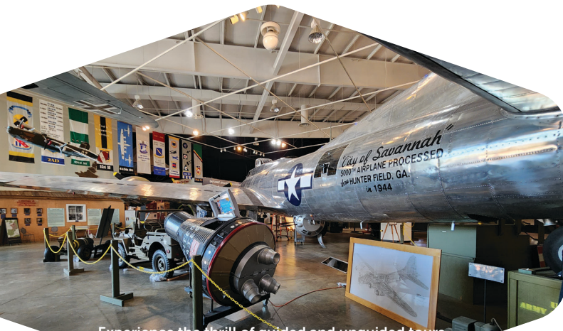
Experience the thrill of guided and unguided tours at the National Museum of the Mighty Eighth Air Force.

Explore ultimate adventures, uncover hidden gems, and all the exciting activities that Pooler has to offer.