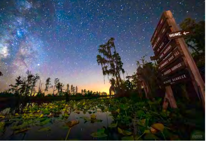
Milky Way at the intersection of the Brown and Red Trails