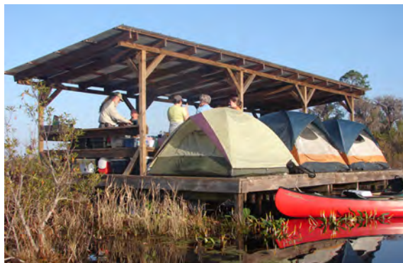
Top, left to right: Maul Hammock, kayak at the beginning of the Pink Trail, Cedar Hammock, Bottom, left to right: Canal Run, Canoeing is one of the best ways to experience the Okefenokee Wilderness, Round Top

pitcher plant, which is a variety of hooded pitcher plant that is endemic to the Okefenokee Swamp.