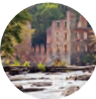
Sweetwater Creek State Park 770.732.5871 www.gastateparks.org/SweetwaterCreek