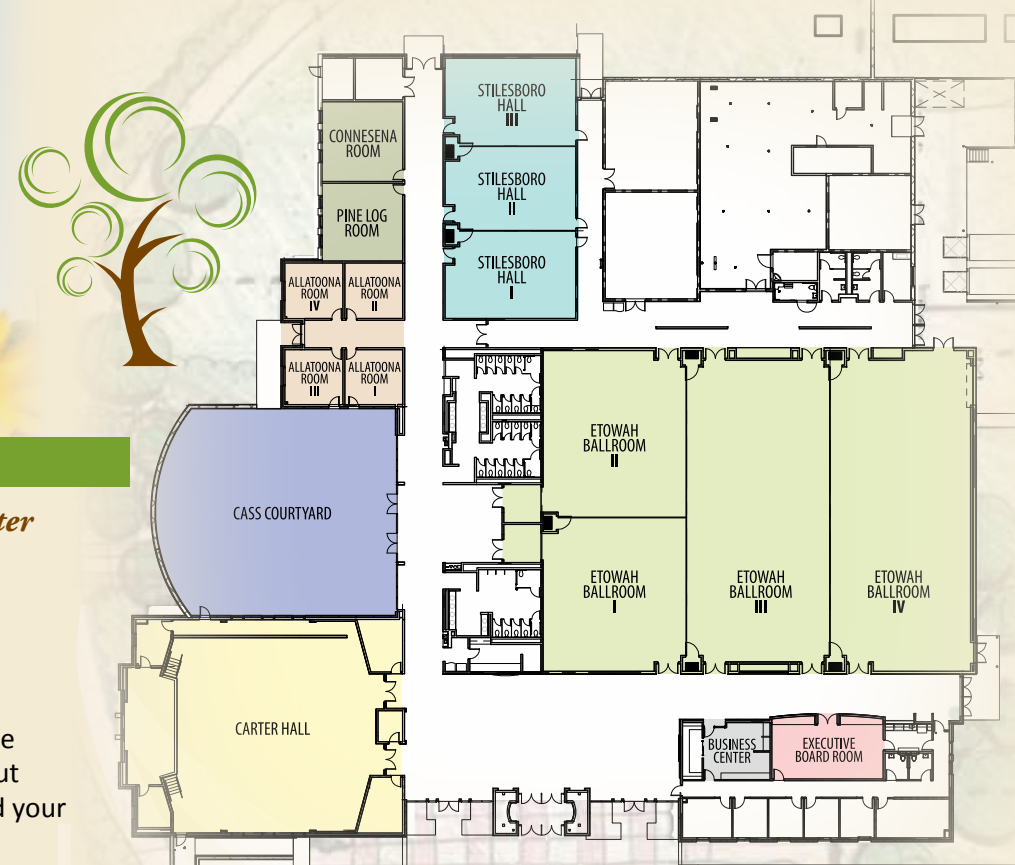
The building is owned by Bartow County Government and operational expenses are supplemented from hotel/motel taxes collected by Bartow County and the City of Cartersville.