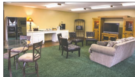
Bears Den Lodge

• Additionally we have a Gift shop, package store, two beautiful wedding gardens and 125 seat chapel.