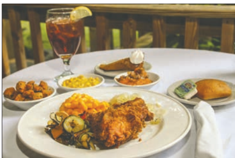
Delicious homestyle meals