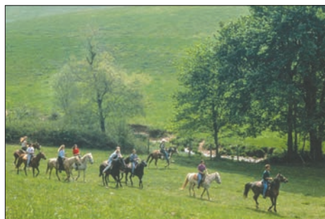
Guided trail rides