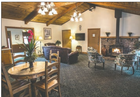
Deer Trail Lodge