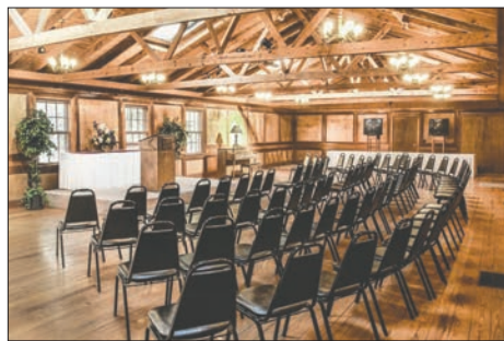
Large & small meeting rooms

'It was so much fun and unique – people still talk about it.'