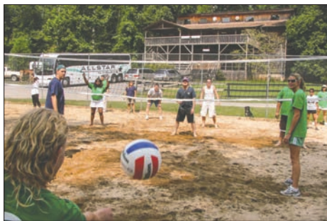
Two sand volleyball courts