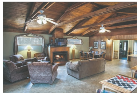
Eagles Nest Lodge