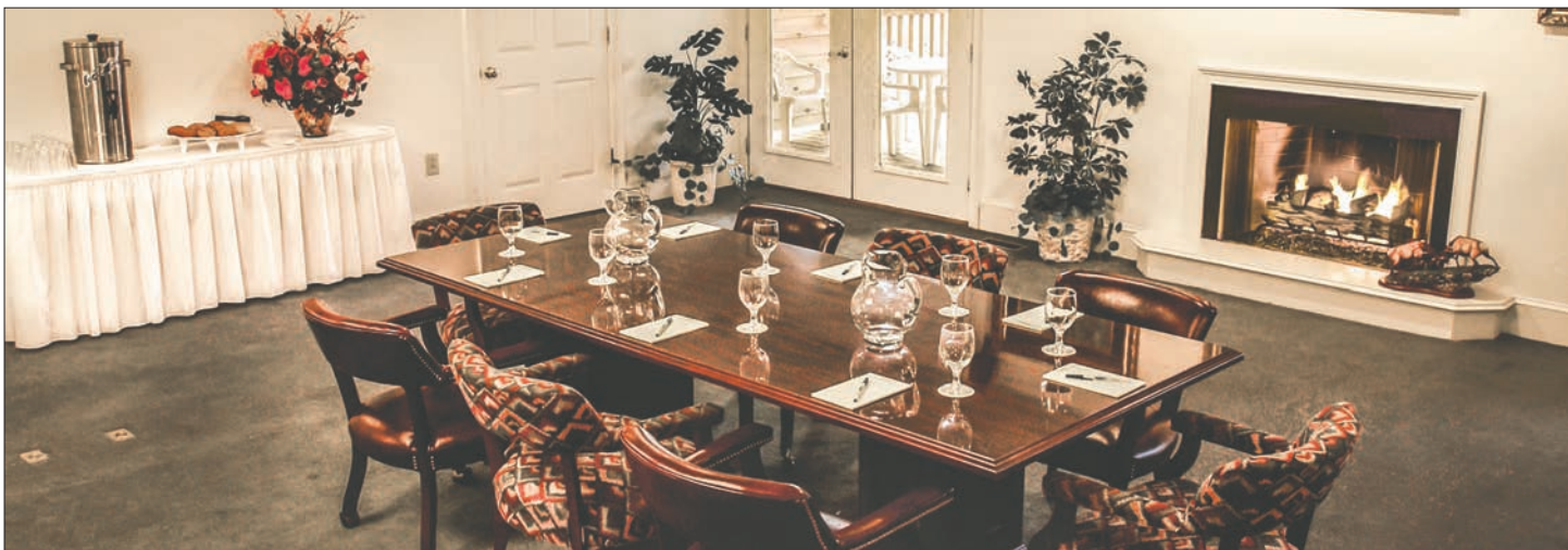
Get down to business in our hospitality suite in the Mountain Laurel Inn.

Separate yourself from your usual surroundings and get down to business in a tranquil, stress-free environment conducive to out-of-the-box thinking, team building and future planning. We offer meeting packages that include all meals, catered breaks, meeting space, free WiFi, team building activities and private group accommodations. You bring your agenda and we'll take care of the rest.