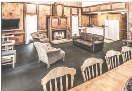
Tree Topper Lodge