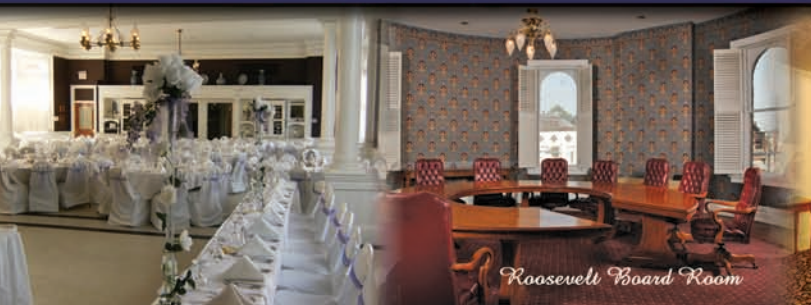
Roosevelt Board Room