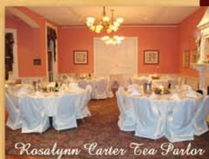
Rosalynn Carter Tea Parlor