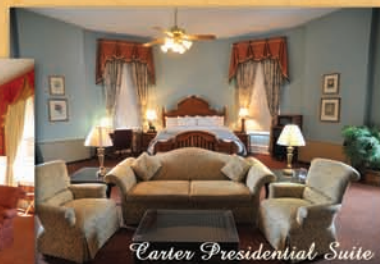
Carter Presidential Suite