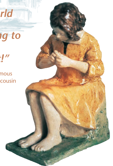
sculpture by Juliette Low