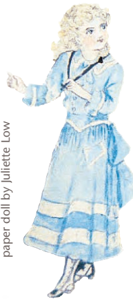
paper doll by Juliette Low