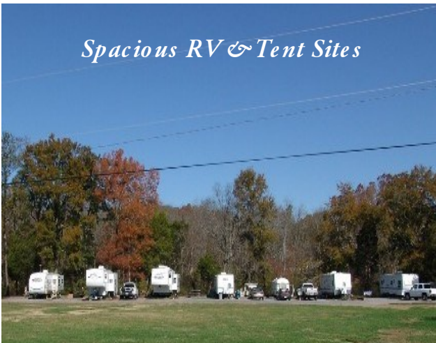
Spacious RV & Tent Sites