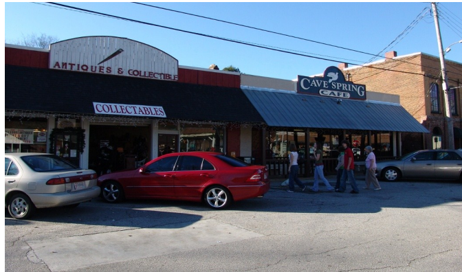
Shop the antique stores and have lunch!