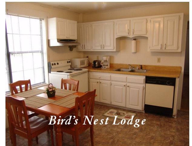
Bird's Nest Lodge