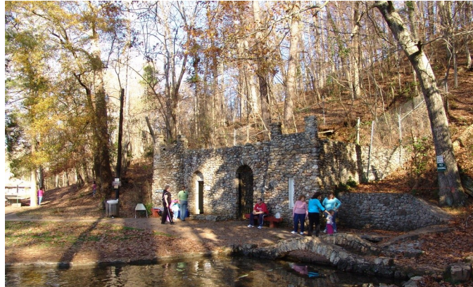
Explore the caves!

We are located 2 miles from the city of Cave Spring!