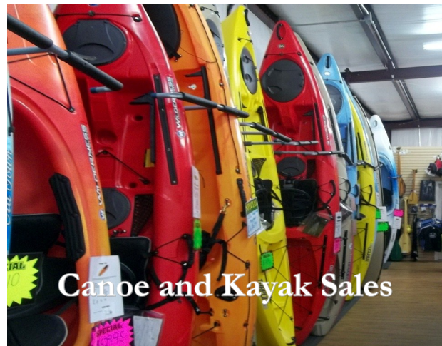
Canoe and Kayak Sales