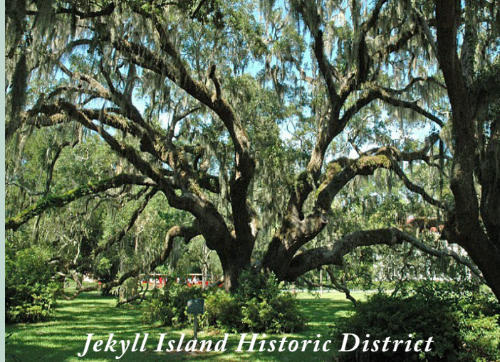
Jekyll Island Historic District