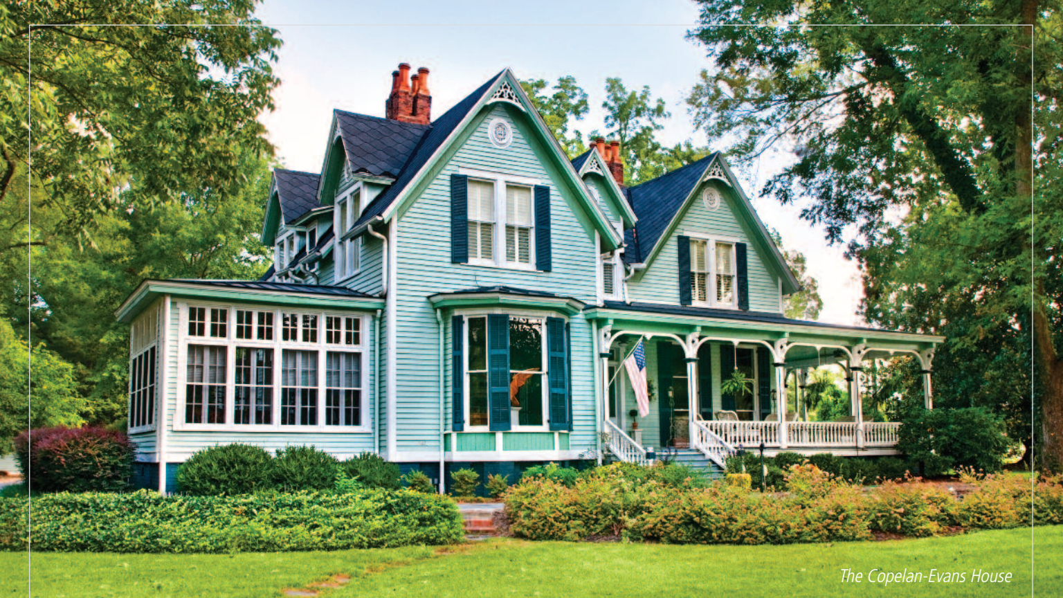
The Copelan-Evans House