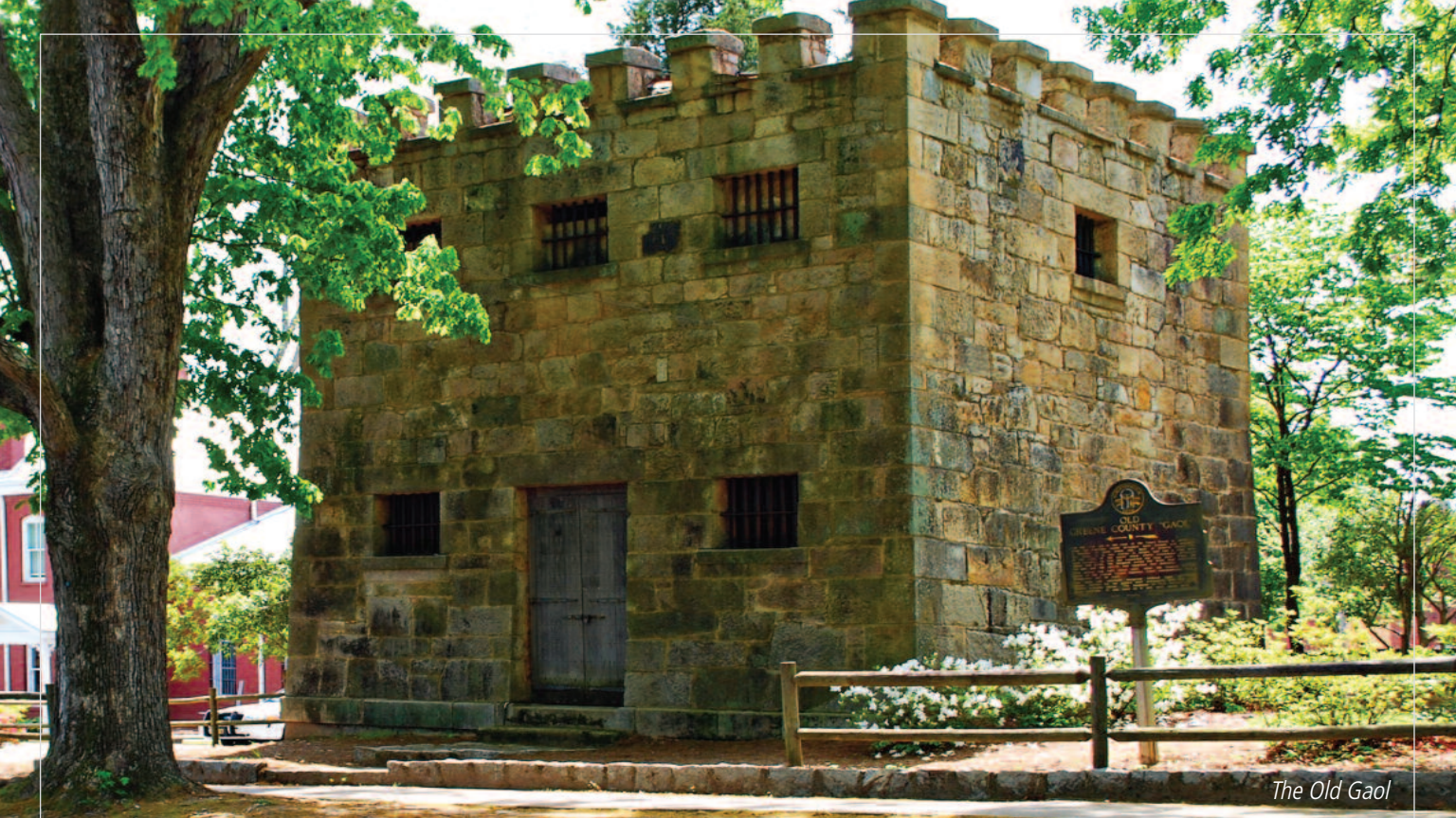
The Old Gaol